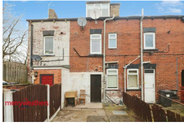
To the rear of the property is an enclosed concreted garden with brick built storage.